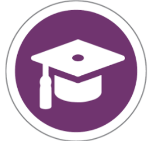
Train the Trainer