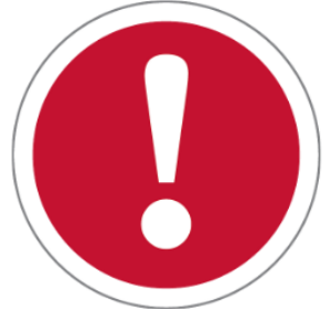
Health & Safety