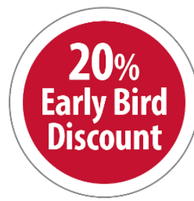
Early Bird Discount