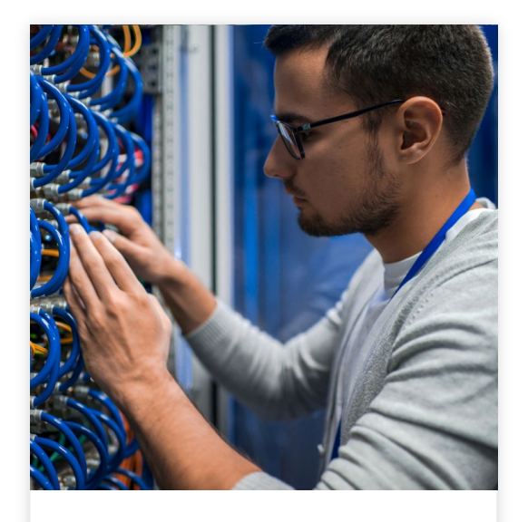
Cisco Networking for Beginners with Career Program

Call 020 7183 8790 for details Mon-Fri, 9am-6pm