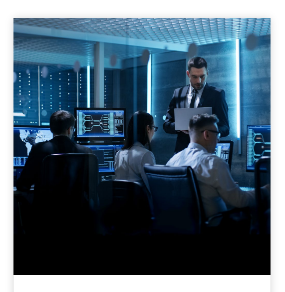
Cyber Security for Beginners with Career Program