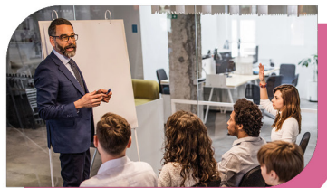
For businesses, our on-site option is the way to train multiple individuals, all at once