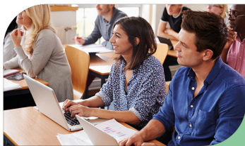
Blended and on-the-job training through Apprenticeships