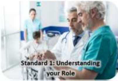
Standard 1: Understanding your Role