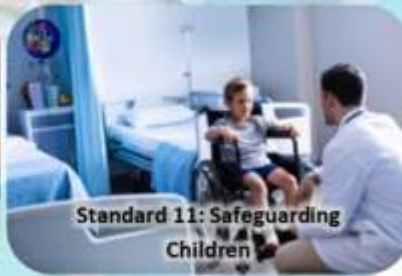
Standard 11: Safeguarding Children