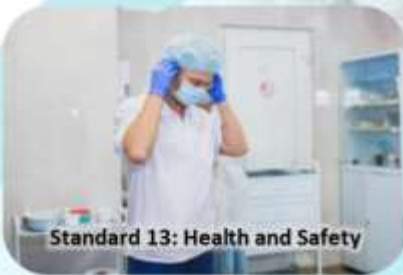
Standard 13: Health and Safety