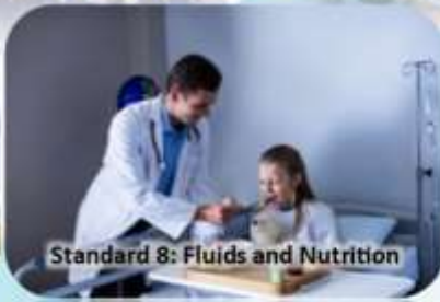
Standard 8: Fluids and Nutrition