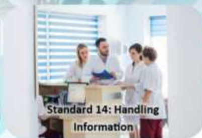
Standard 14: Handling Information