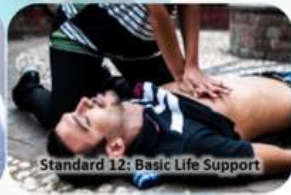
Standard 12: Basic Life Support