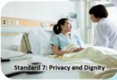
Standard 7: Privacy and Dignity