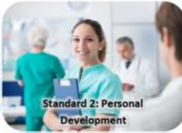
Standard 2: Personal Development