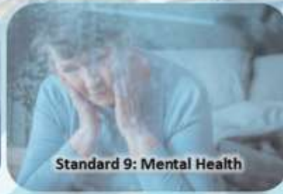
Standard 9: Mental Health