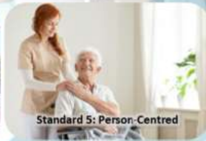
Standard 5: Person-Centred