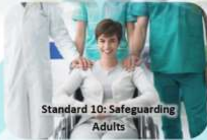
Standard 10: Safeguarding Adults