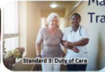
Standard 3: Duty of Care