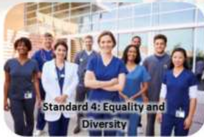
Standard 4: Equality and Diversity