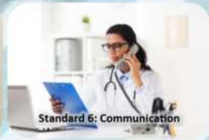
Standard 6: Communication